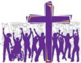
2012 ELCA Youth Gathering citizens with the saints Ephesians 2:14-20